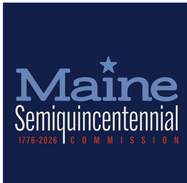
Exhibit A – Maine Semiquincentennial Logo

11.11 Survival. The provisions of paragraphs (including sub-paragraphs): Ownership of the Logo, Representations and Warranties, Indemnification and Limitation of Liability, and Miscellaneous Provisions survive the expiration or termination of this Agreement.